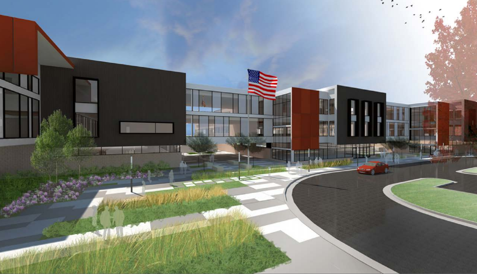
JOPLIN HIGH SCHOOL Joplin, Missouri