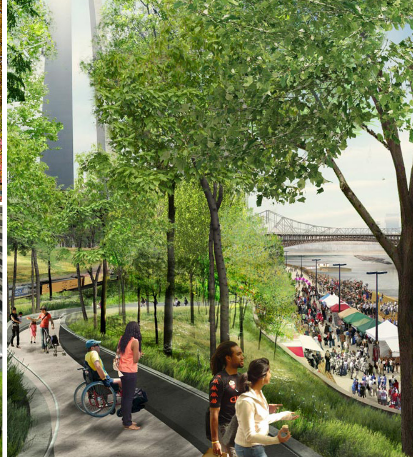
ST. LOUIS GATEWAY ARCH GROUNDS PROJECT St. Louis, Missouri