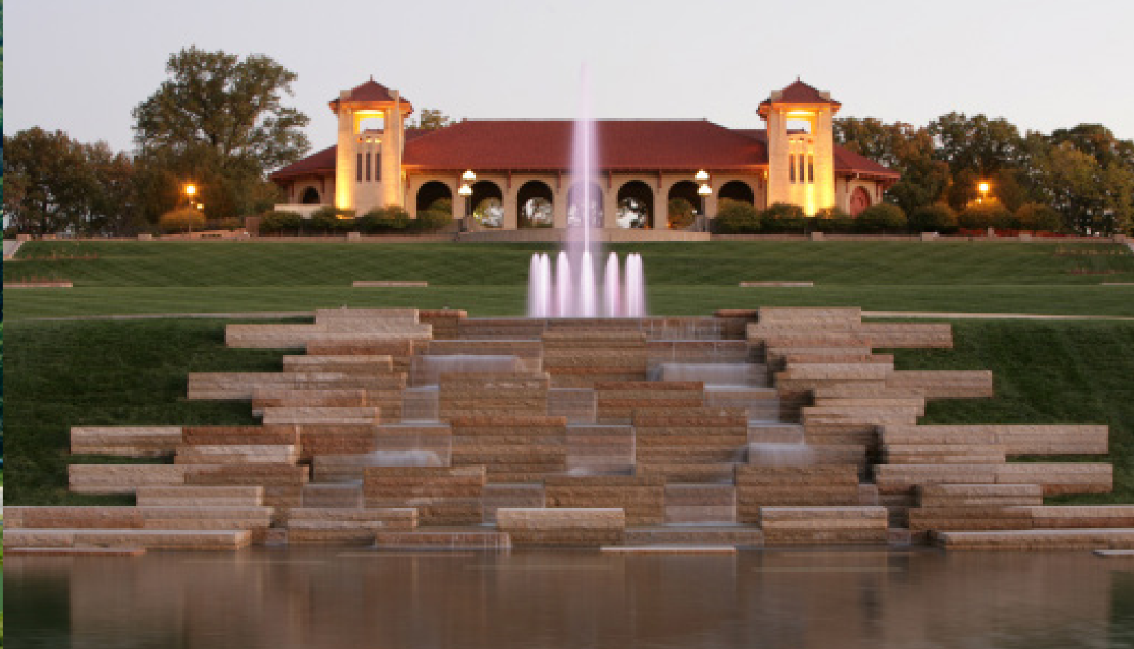
GOVERNMENT HILL/FORREST PARK St. Louis, Missouri