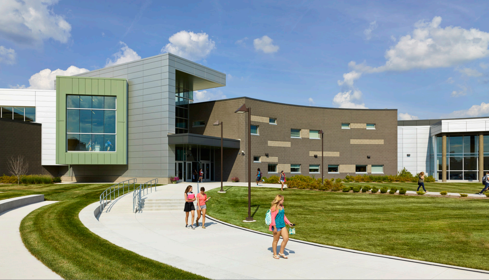
BATTLE HIGH SCHOOL Columbia, Missouri