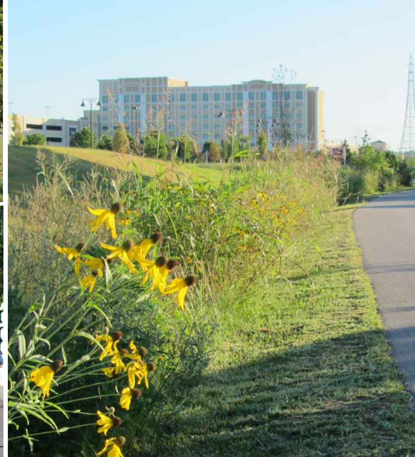
MISSISSIPPI RIVER GREENWAY St. Louis, Missouri