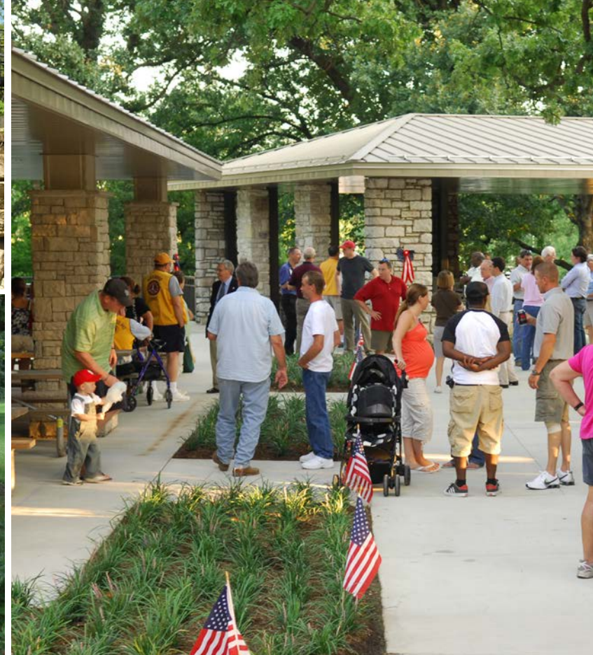
KIRKWOOD PARK Kirkwood, Missouri