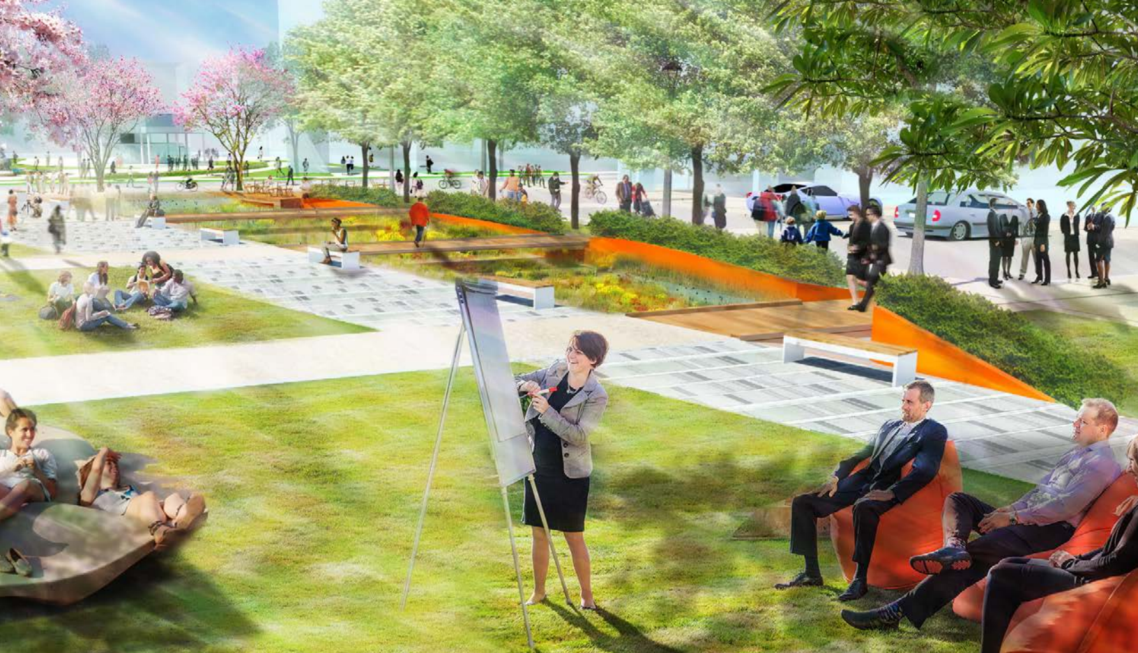
CORTEX INNOVATION COMMUNITY St. Louis, Missouri