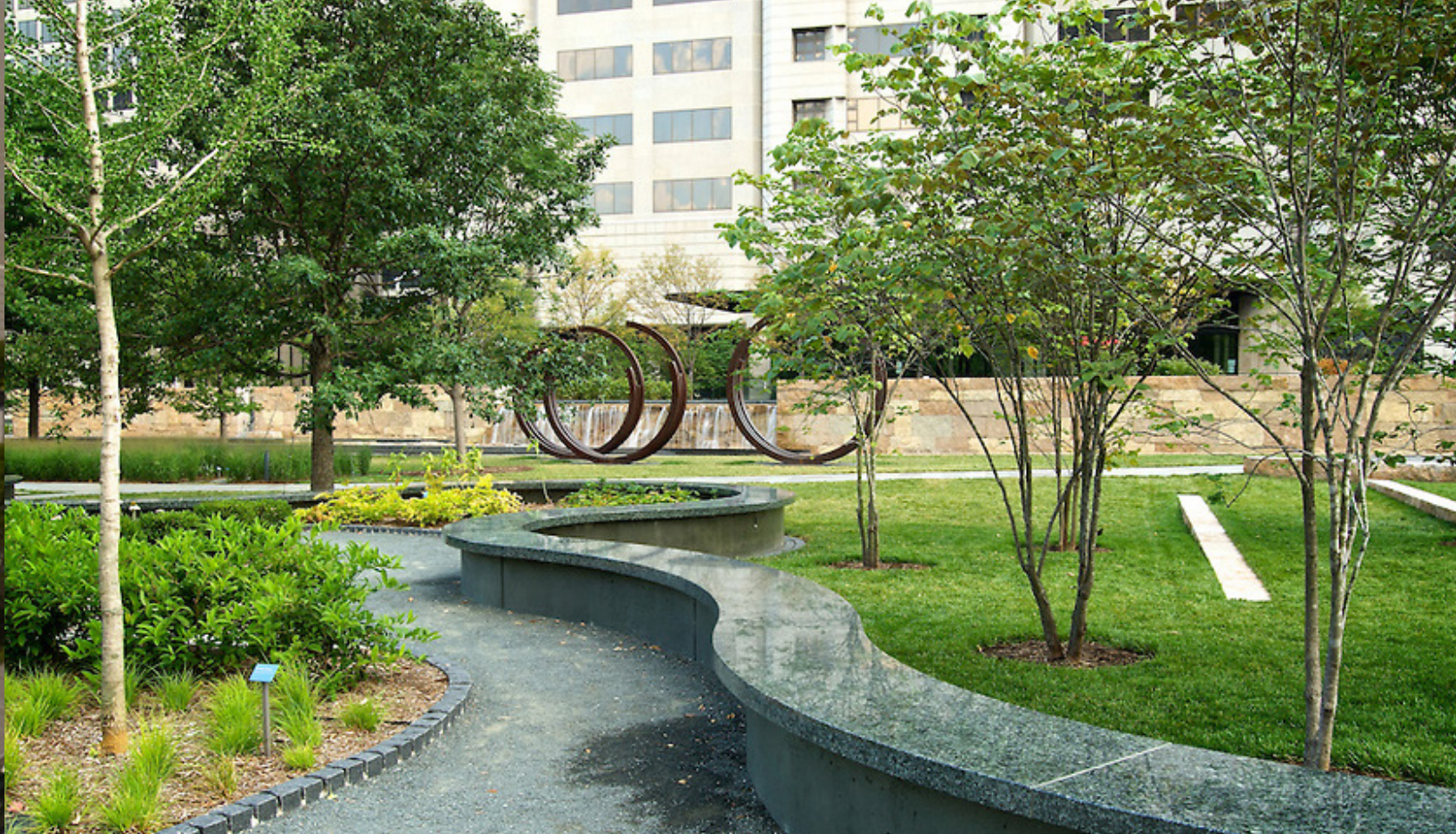
CITYGARDEN St. Louis, Missouri