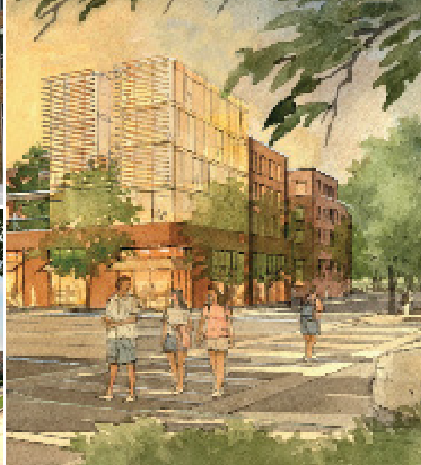
LOFTS OF WASHINGTON UNIVERSITY St. Louis, Missouri